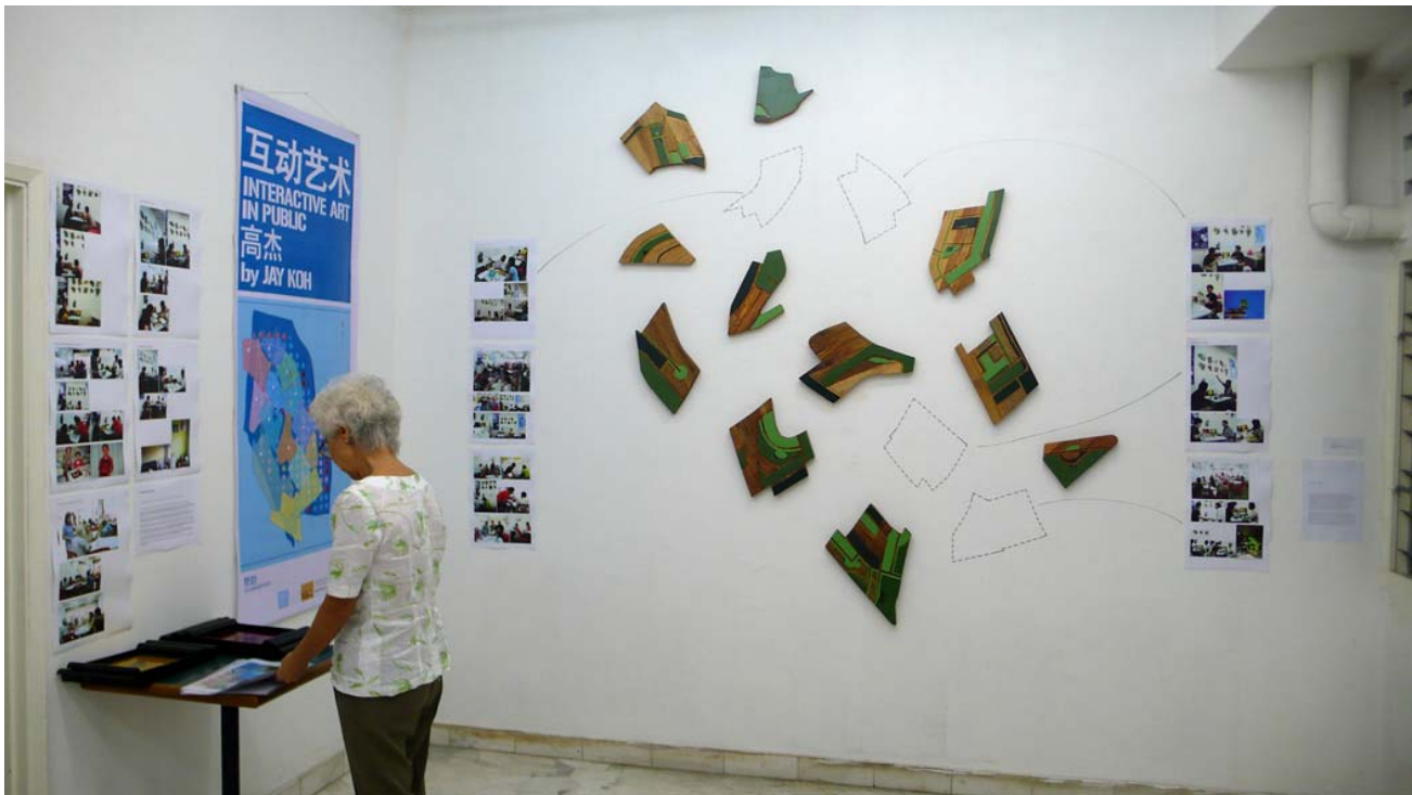
Conversation Pieces, exhibition of project documentation in 1948 Artspace, Seri Kembangan, Malaysia