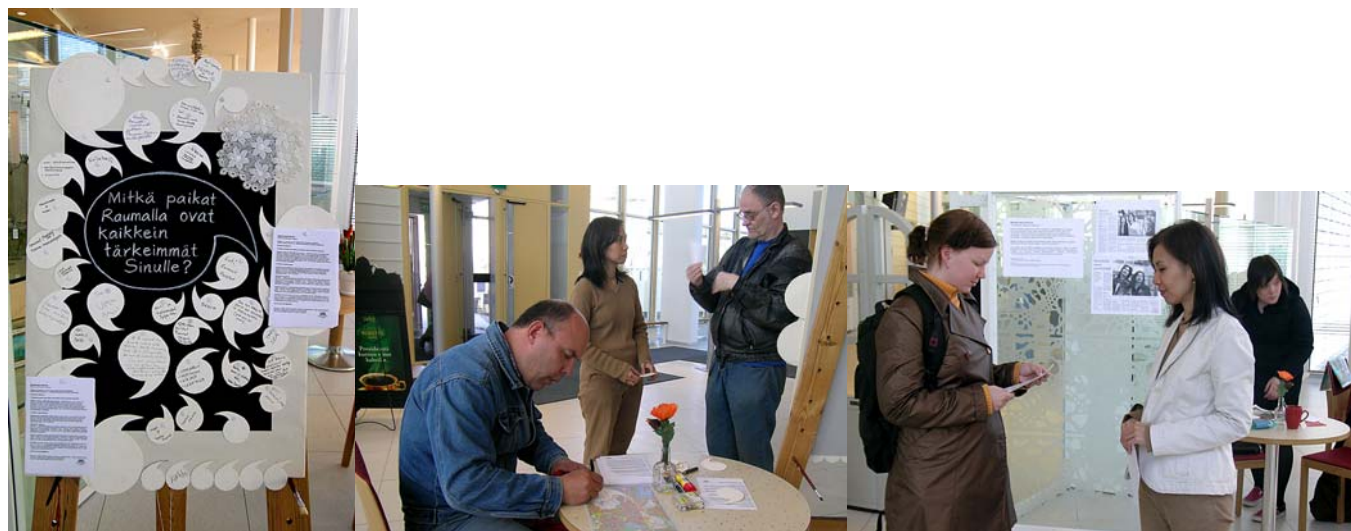
Interactions with the residents in the Rauma public library, with interactive tools for conversation, for period of 14 days

The basic idea for the residency project was to jointly bring residents through a journey where they can become excited about representing some aspects of their lives through visualizations and a process of collective creative negotiation and dialogue.