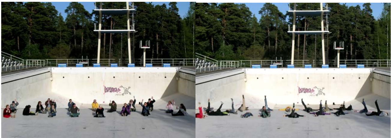
Performance "Swimming in Air", by Rauma residents who grew up hanging around this pool