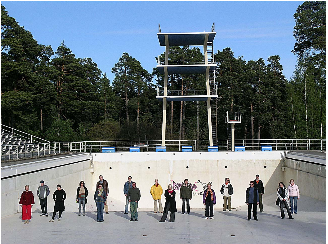
Residents' struggle: how to preserve the old outdoor swimming pool from disuse and possible destruction by city authorities