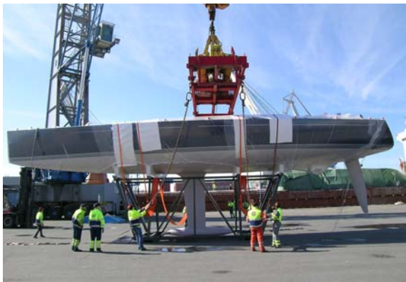
Interviewing harbour employees. The harbour has been a safe haven of employment for generations of Raumans.