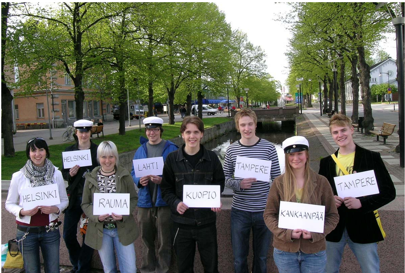
Residents' anxiety: Rauma is not a town for young people. Youth indicating the cities they have to head for in pursuit of higher education. Many do not return.