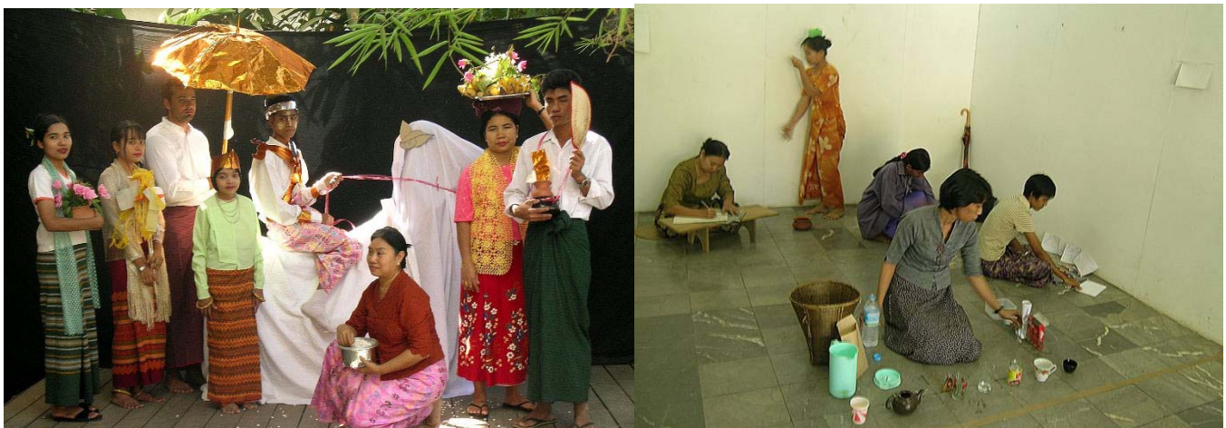
Bottom Left: Creating a Tableau Vivant based on Myanmar Buddhist rites with workshop participants, and Right: Another workshop activity, workshop by Swiss artist Pascale Grau, NICA in 2005