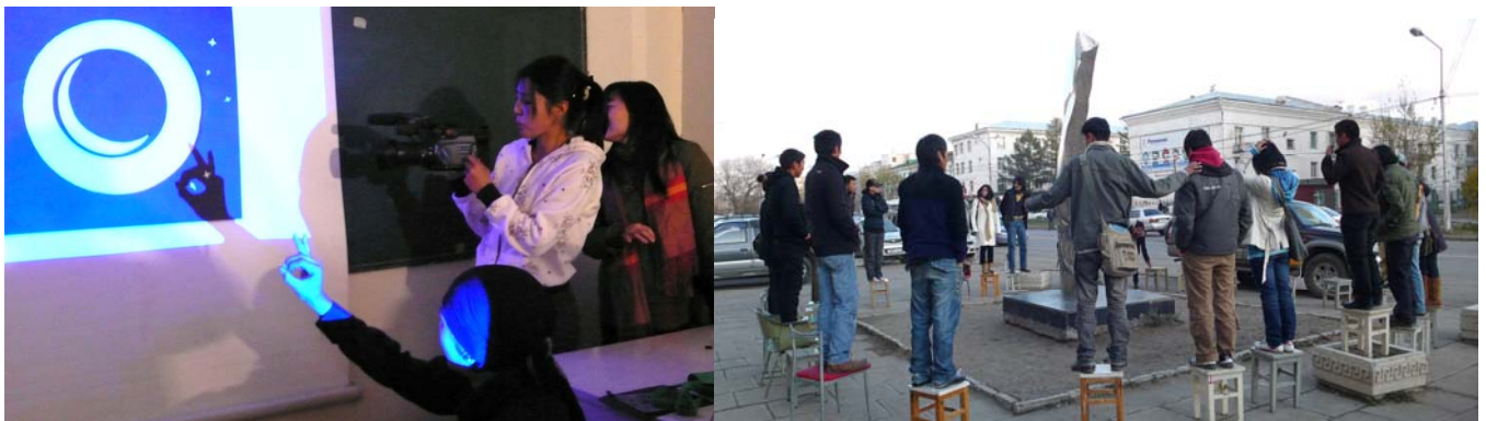
Scenes from workshops with artists and art students of the Fine Art Institute in Ulaanbaator in Open Academy Mongolia 2008