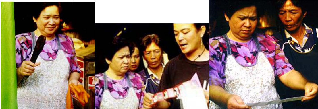
The process of the exchange – woman exchanging fish scaling tool for a drawing.