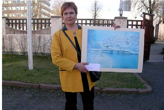
Objects accompanied by written stories which tell of people's attachment to Rauma