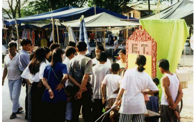
Various markets at which the exchanges took place