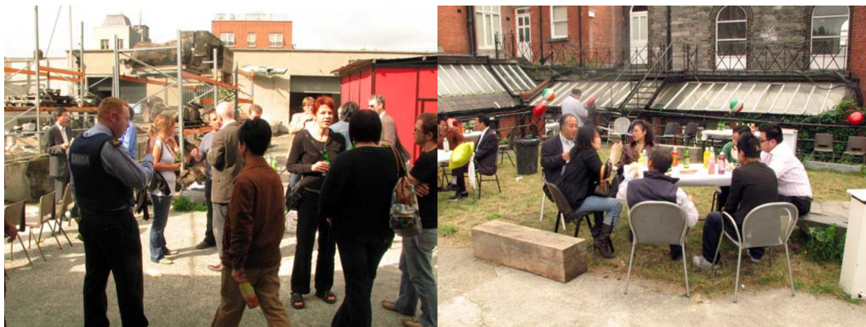
Activities organized under the Ireland Chinese Cultural and Sports Association

It uses art creatively as a tool to facilitate integration as a dynamic, two-way process of mutual accommodation, employing dialogical and participative art activities to create channels between the Irish communities and the students and migrants from north eastern China. After a period of research and relationship building, the project proposed a set of cultural activities to alleviate cross community and/or workplace issues through mutual consultation, common activities and platforms. Activities that have been organized include visits, interviews and private conversations; Chinese and Irish artist informal evenings (twice a month); cultural exploration workshops in Chester Beatty Library; organizing the Chinese Singing and Song writing event; the organizing of a Chinese Social BBQ event and the creation of the Ireland Chinese Cultural and Sports Association. Further events are being planned for 2009.