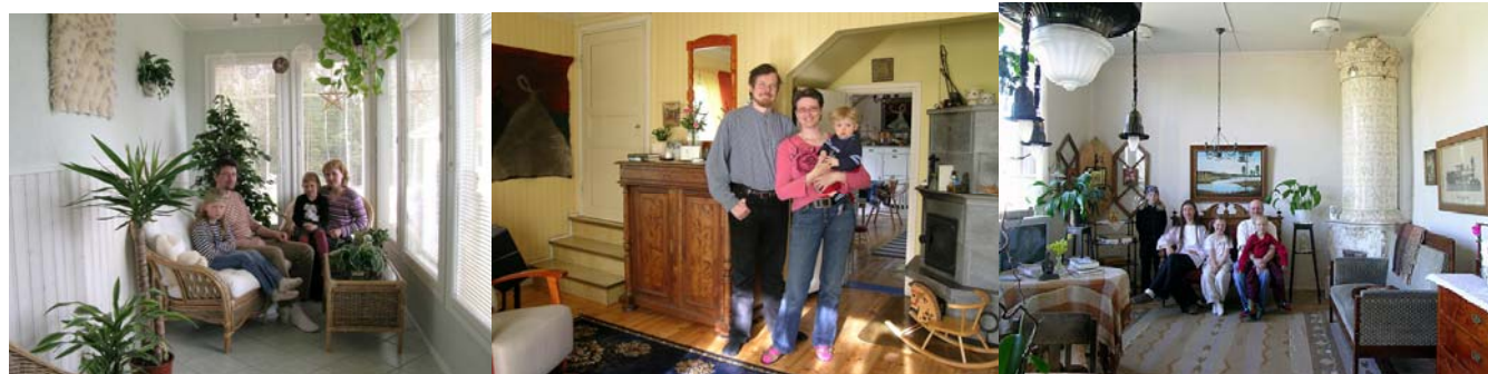
Home – the most important place expressed by most residents

The interactive opportunities offered and actions accomplished by the project: