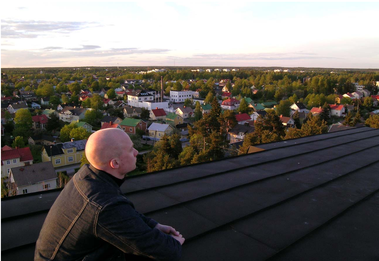
Resident's need: Seeking out time and place to be alone in this town where everyone knows your business even ahead of yourself.