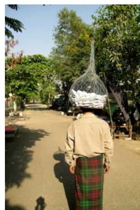
Top row: Offering of mind: young aspiring entrepreneur; Bottom, left to right: Offerings of mind: housewife, student, artist, vendor

As a continuation from the Stupa Of the Mind series, in which the sculptural form worn on the head symbolizes a mental stupa, in the Offering of Mind series, participants were requested to write their most powerful thought or hope on pieces of paper and place them into the mental stupa as 'offerings of mind'. In this second work, the stupa-like form also symbolises a cage, with the wishes and thoughts trapped within unable to find realisation as yet. This series of performance for photography have been staged with participation by colleagues, friends and members of the community whom I work with. The photographs are a visual representation of the ironical state that the people are located in - trapped between the propaganda of offering and submission of self that promises escape from the suffering of this life, and the very real inability to escape from the political environment that produces more bodies of desires and longings that are prevented from realisation.