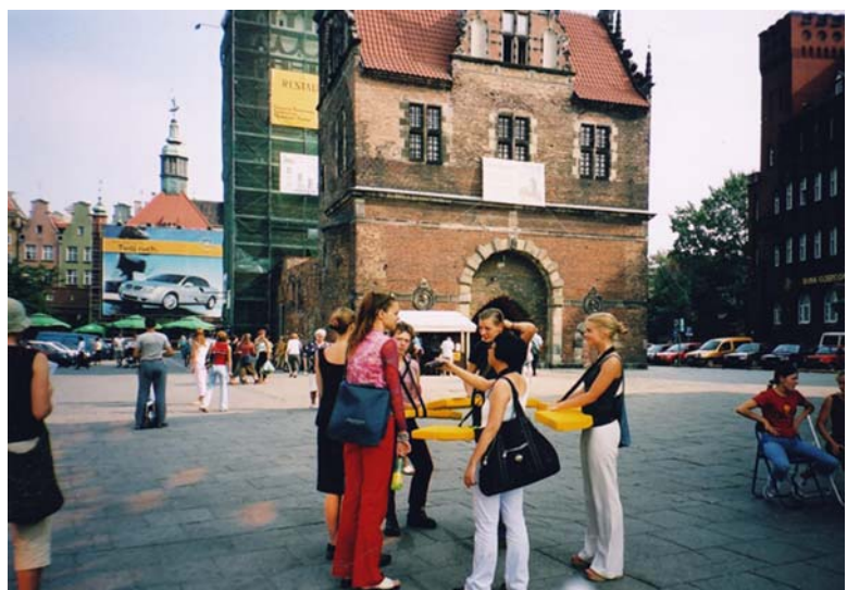
Mobile forums in action in parts of the city