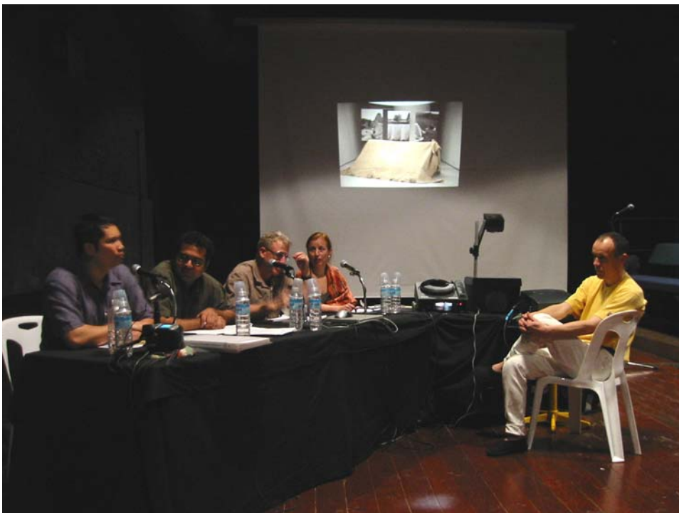
Top left : Interviewing a participant. Right: interaction in Tampines public library Bottom: One of the panels in the International Symposium on Public Engaged Art