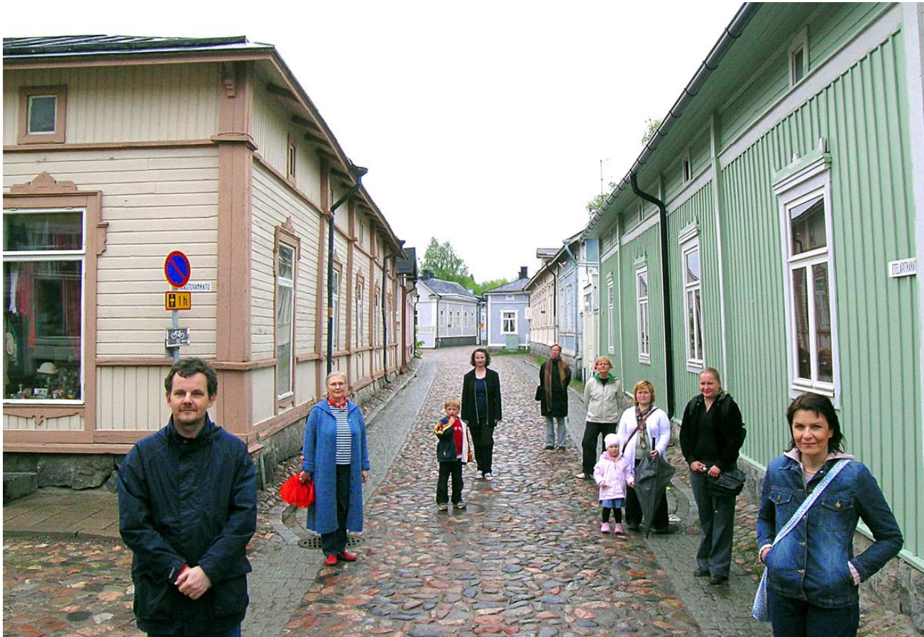
Residents' pride: Old Rauma with its 200 over year old houses, a UNESCO world heritage site.